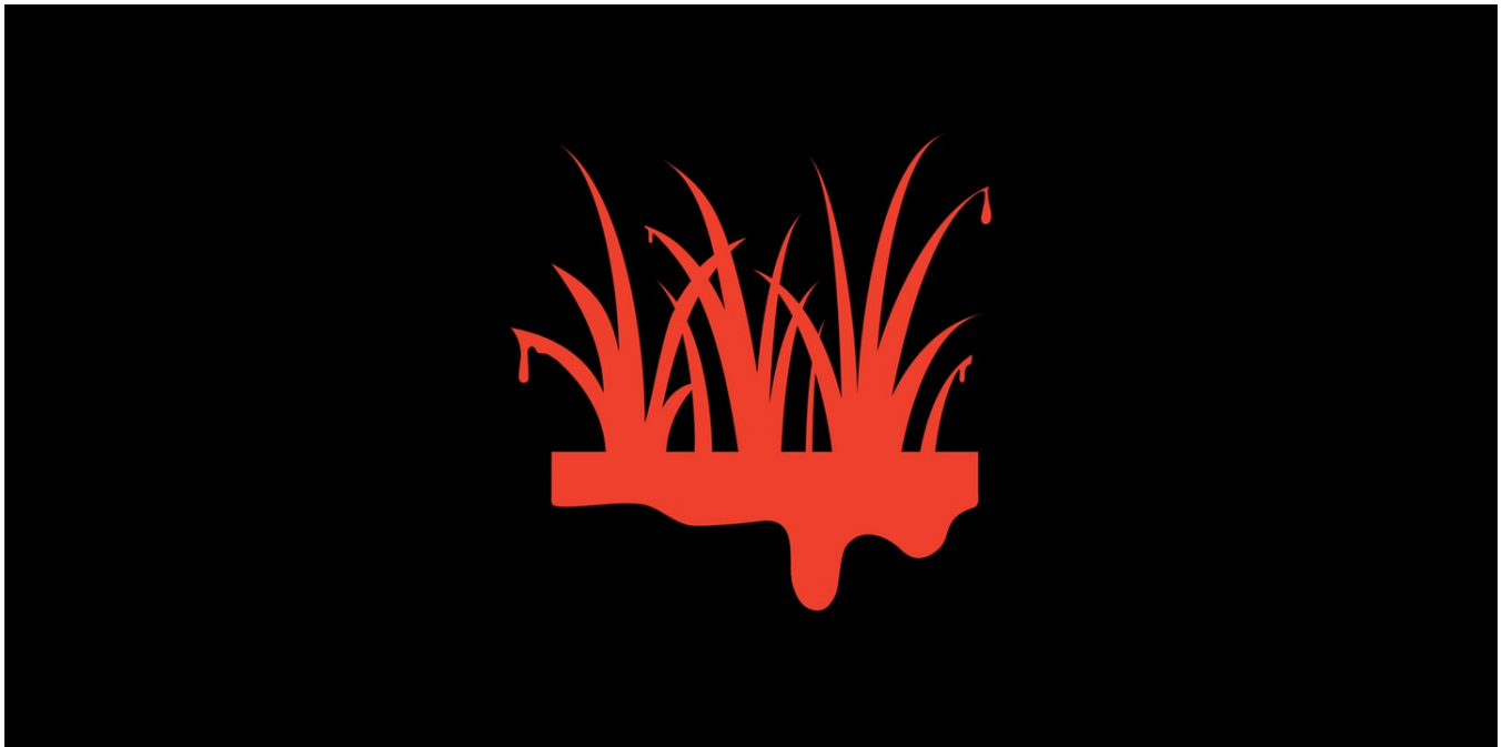
Illustration: Soohie Cho/The Intercept

PFAS chemicals have been identified in synthetic turf, according to lab tests performed on several samples of the artificial grass that were shared with The Intercept. The presence of the chemicals, members of a class that has been associated with multiple health problems, including cancer, adds to growing concerns about the grass replacement that covers many thousands of