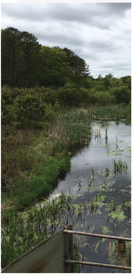
Town of Mashpee Upper Quashnet River

The costs for Mashpee to implement the SWMP is approximately $48,000 per year, with some year-to-year variability over the next 5 years. The costs may be lower depending on the use of inhouse resources. These costs do not include drainage system maintenance (e.g. sweeping or catch basin cleaning, etc.), correction of illicit discharges, or design and construction of stormwater management facilities.