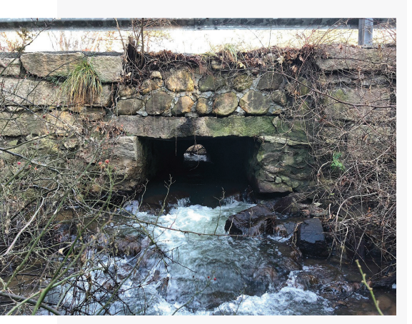
Town of Mashpee Santuit River Culvert

The more impervious surface, the more stormwater runoff and therefore the greater impact to local waterbodies. Clean stormwater runoff from natural areas is an important source of recharge to the groundwater; replenishing drinking water wells and supplying base flow to lakes, ponds, springs, brooks and wetlands.