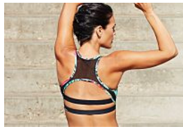
Why Are Girls Flipping Out Over Kate Hudson's New Fabletics by Kate Hudson