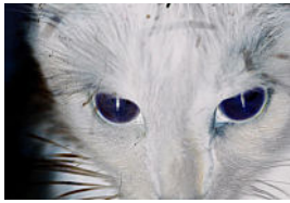
What Cats and Dogs Can See that Humans Can't: You Pet MD