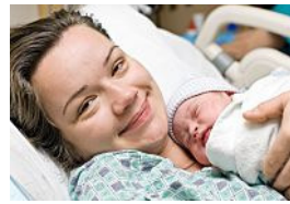
15 Names That Are Going Extinct ParentingCollective.com