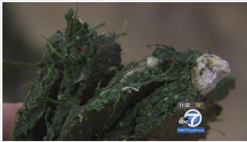
Sports fields at five Los Angeles high schools will be replaced after the plastic that made the base of the synthetic turf fields melted into clumps.