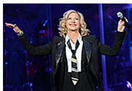
No Way They're 60-Plus! AARP