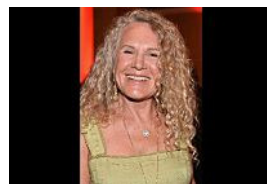
The Richest Woman in the World is Worth $41.7 Billion Forbes